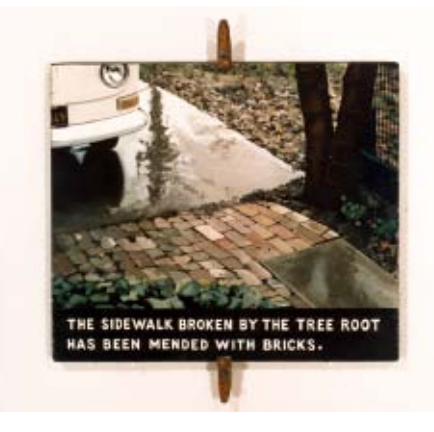
Home Improvements (tree root repair), 1980, Acrylic on masonite, 11 x 13 inches, Courtesy of the Artist