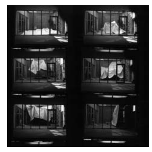
Large Variable Construction, 1968, (Installation at San Jose City College), Cotton fabric, wood frame and string, Courtesy of the Artist; Photo Credit: Mary Auvil